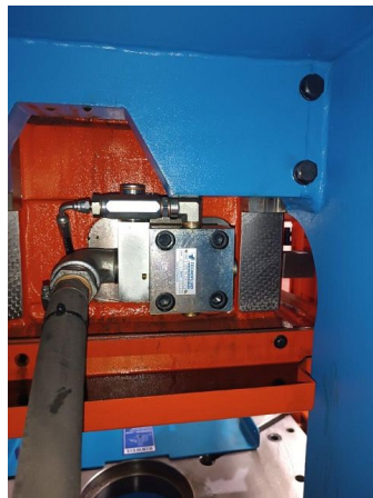
Hydraulic safety valve