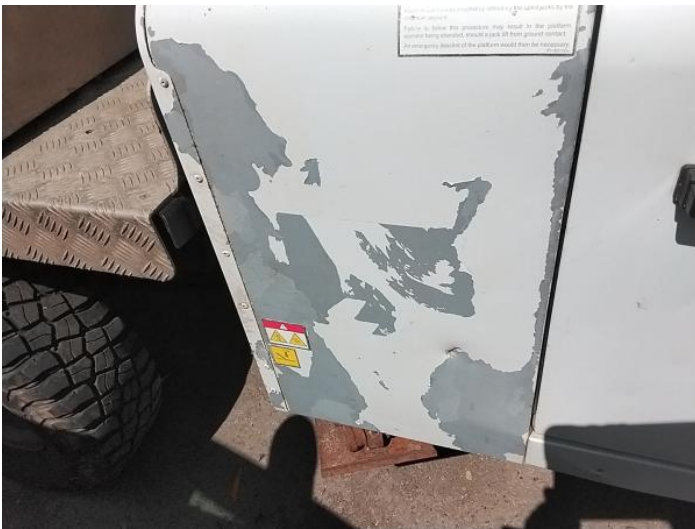
11: Qtr Panel osr Scratched Over 25mm Thru Paint