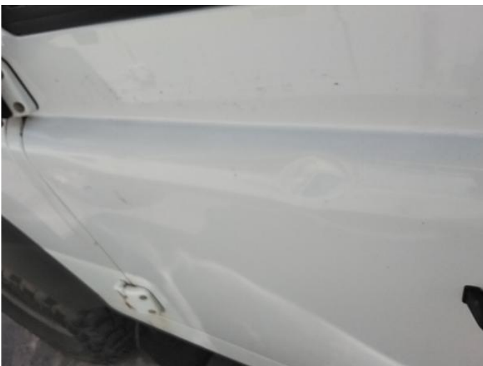
7: Door nsf Dented Over 30mm