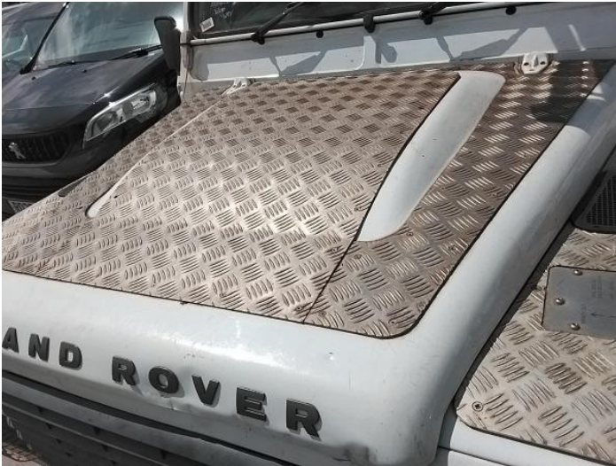
3: Bonnet Scratched Over 25mm Thru Paint