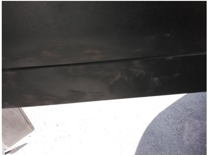
18: Door Pad osf Soiled Heavy