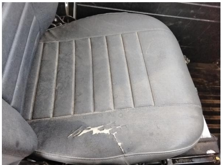
20: Seat Base Cover nsf Torn Over 3mm