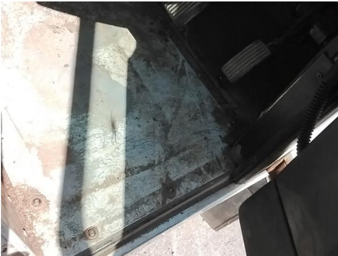
17: Carpets Front Missing Replace