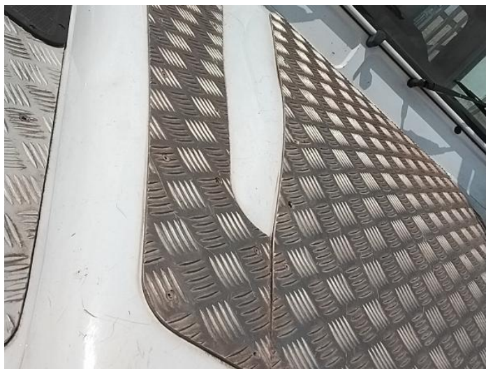
2: Bonnet Dented Over 30mm