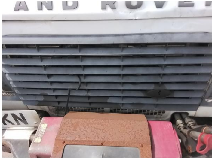
4: Panel Front Dented Over 30mm