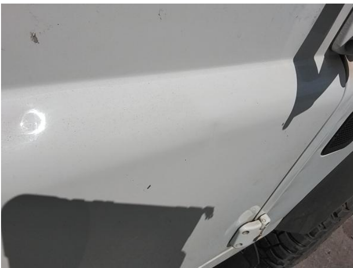
13: Door osf Dented Over 30mm