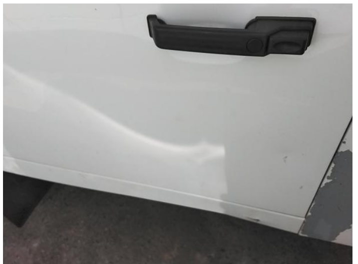
8: Door nsf Dented Over 30% Of Panel