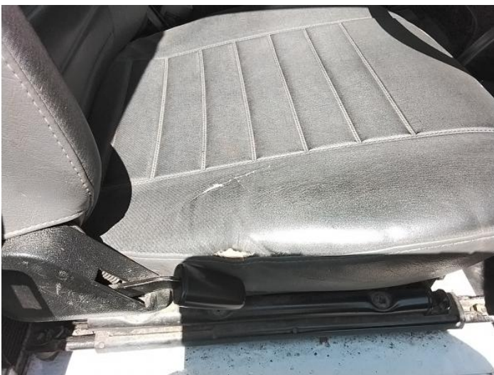
19: Seat Base Cover osf Torn Over 3mm