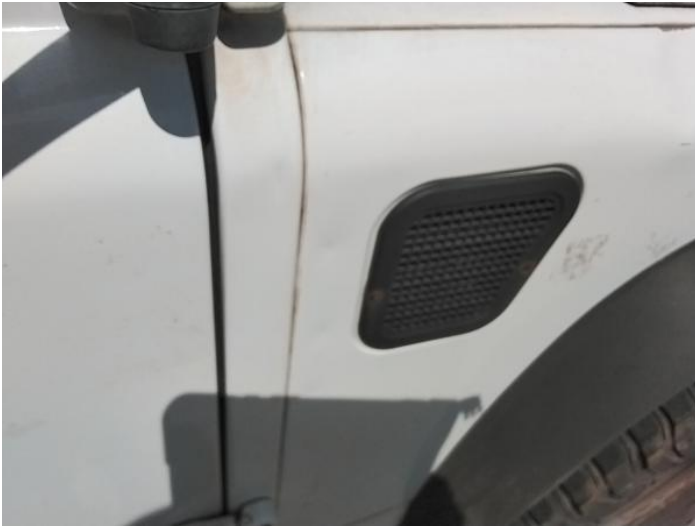
15: Wing osf Dented Over 30mm