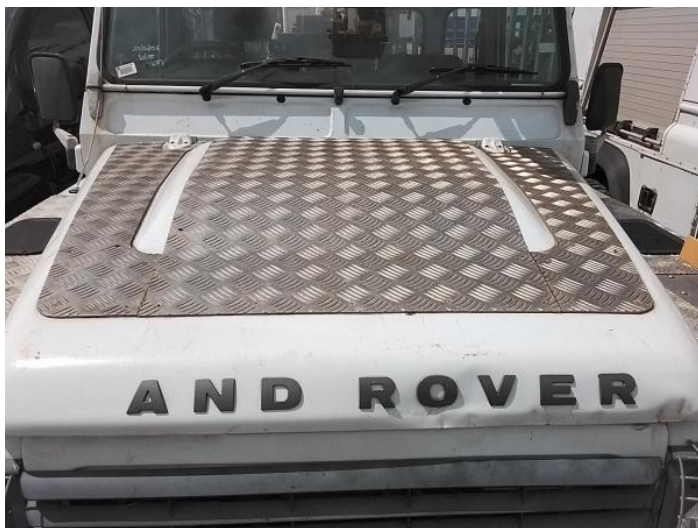
1: Bonnet Dented Over 30mm