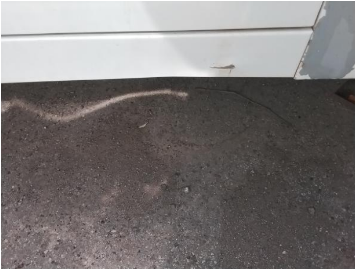
9: Sill ns Dented With Paint Damage