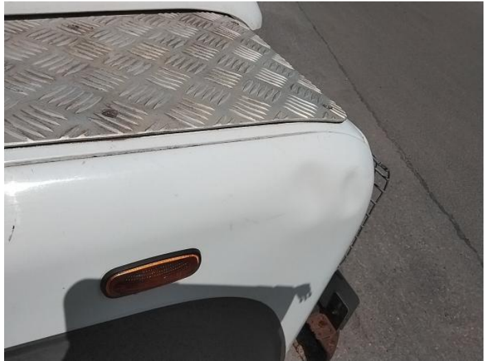
16: Wing osf Dented Over 30mm