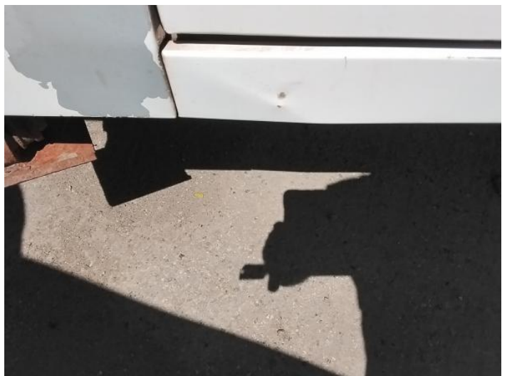
14: Sill os Dented With Paint Damage