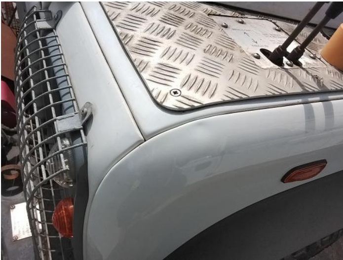
5: Wing nsf Dented Over 30mm