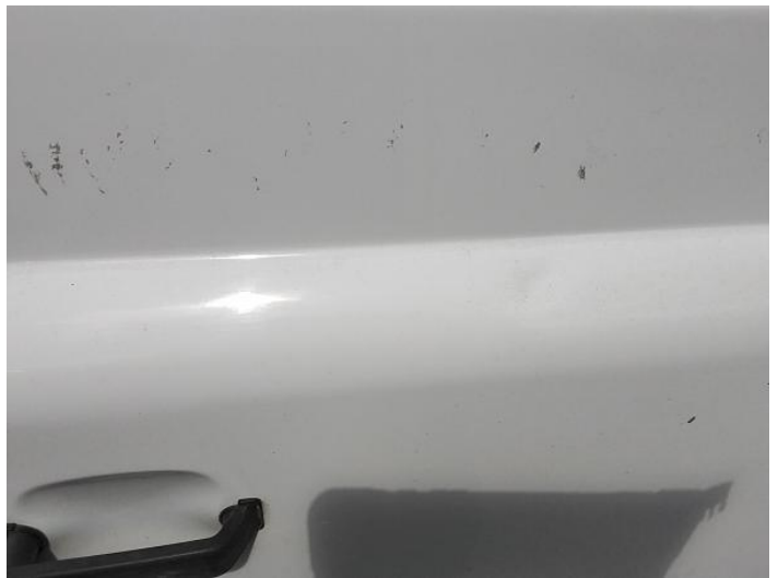
12: Door osf Dented Over 30mm