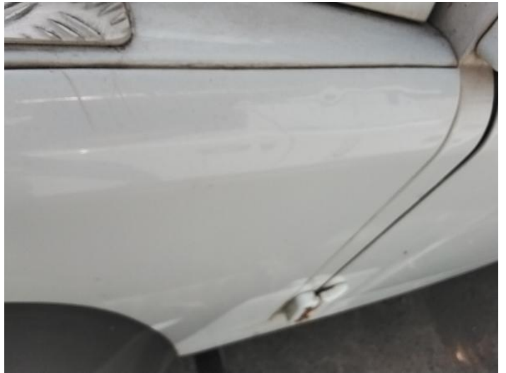
6: Wing nsf Dented Over 30mm